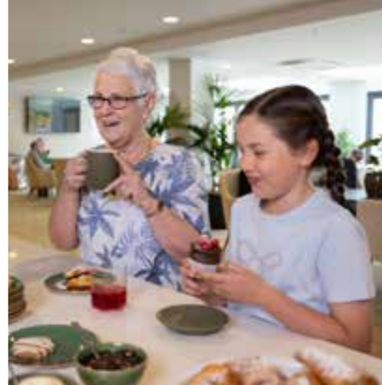
Spaces to Connect