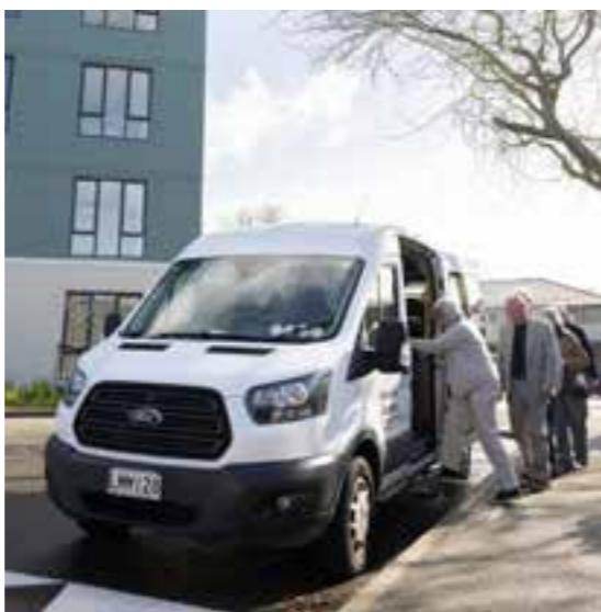
Village Shuttle Bus