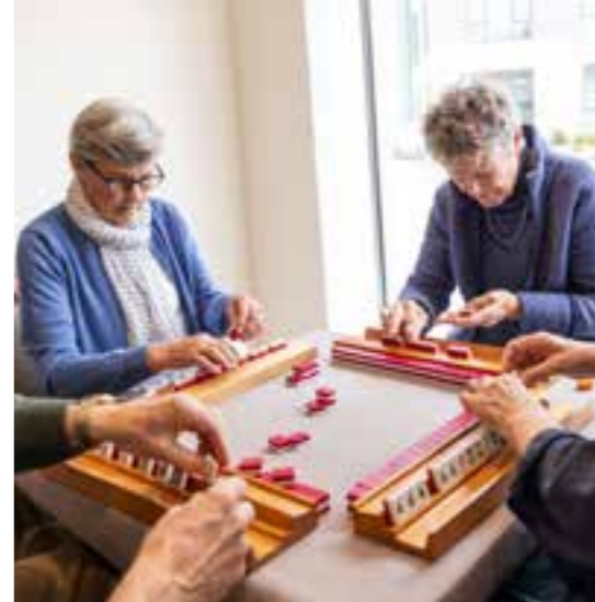
Puzzles, cards & games groups