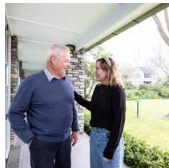
Walk the grounds