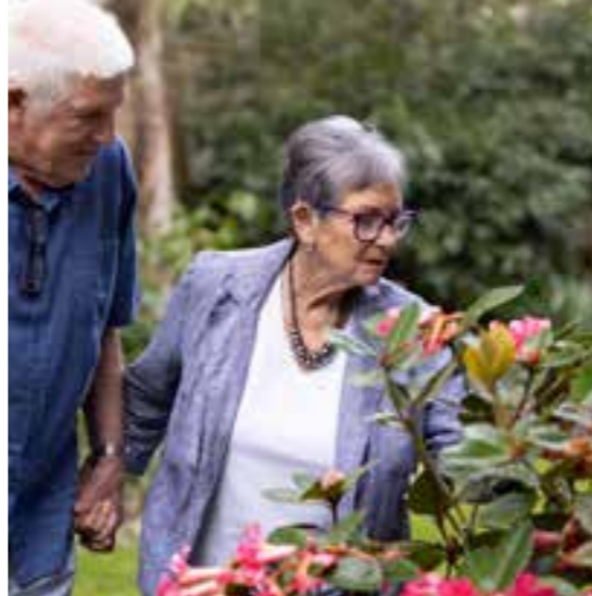
Monthly garden centre visits