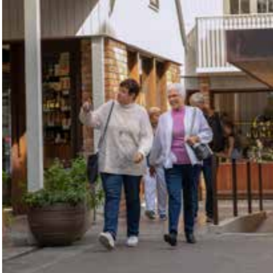
Day trips & shopping excursions

Life here moves at your pace. Residents are free to be as involved or as independent as they choose – whether that means filling the week with activities and social events, or simply enjoying the comfort and privacy of their own space.