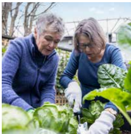
Onsite gardeners & maintenance