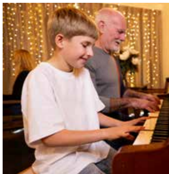
Grand piano & dance floor