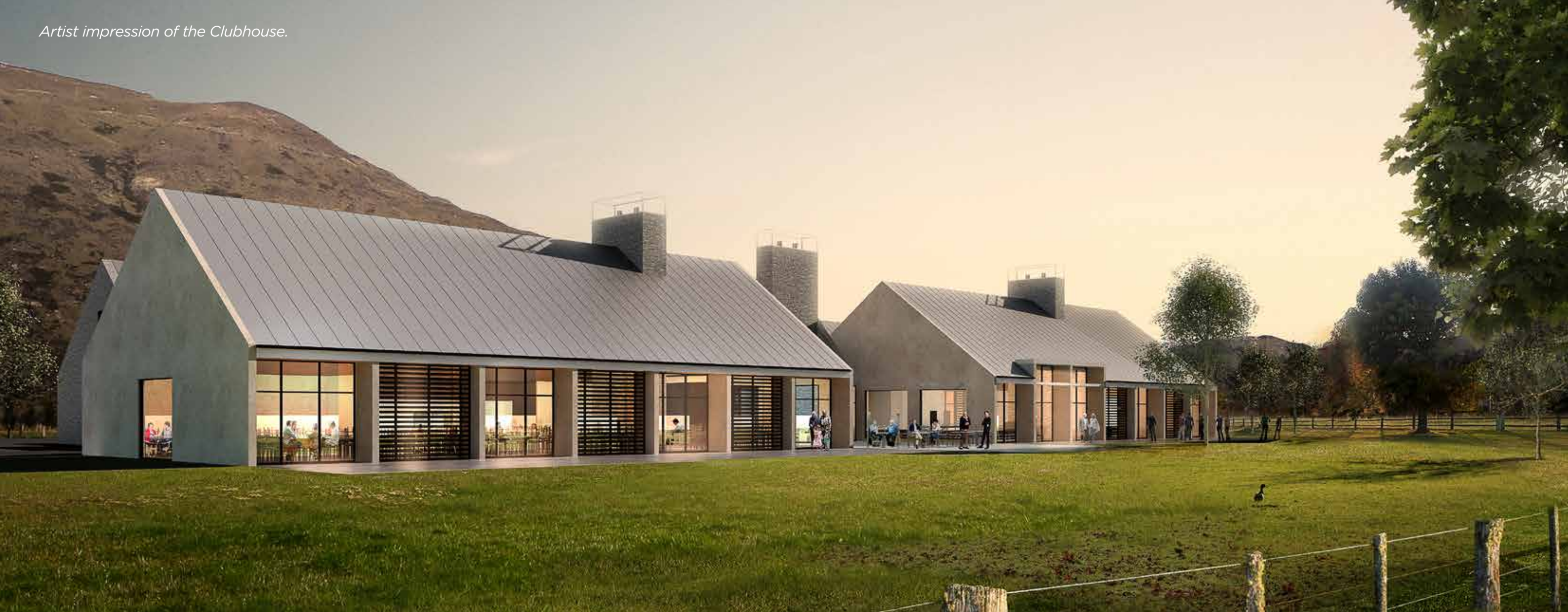
Artist impression of the Clubhouse.