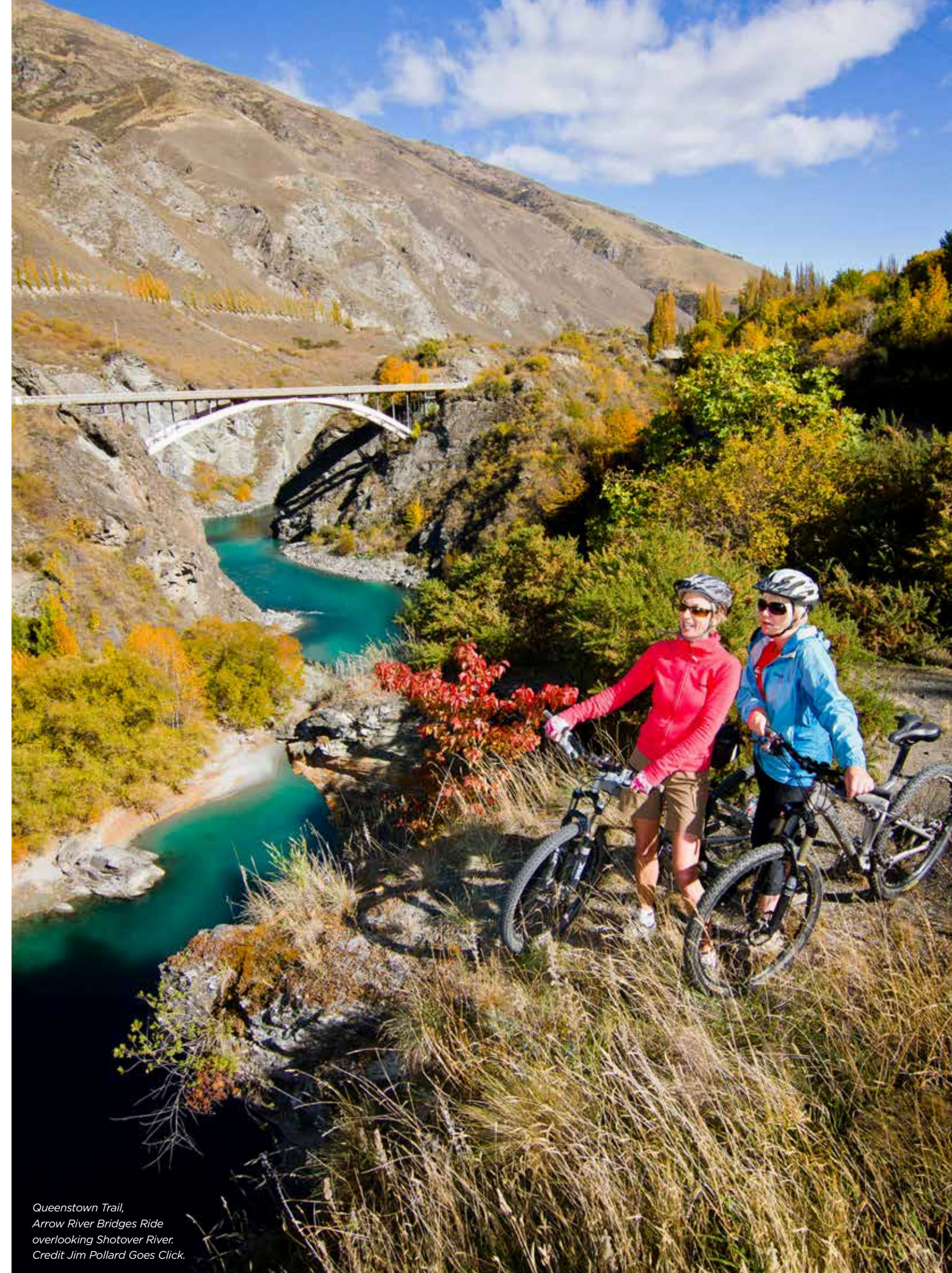
Queenstown Trail, Arrow River Bridges Ride overlooking Shotover River.

We'd love the chance to show you around and answer any questions you have. If you'd like to be a part of this exciting new community, contact us on 0800 111 410 or email sales@queenstowncountryclub.co.nz