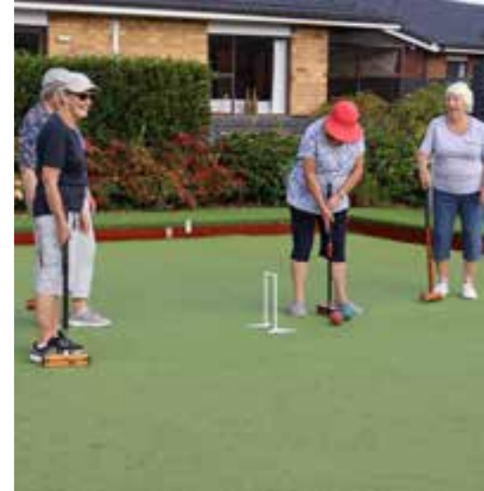
Bowling and Croquet competitions