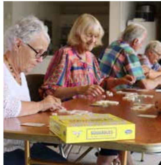
Cards, games & leisure afternoons