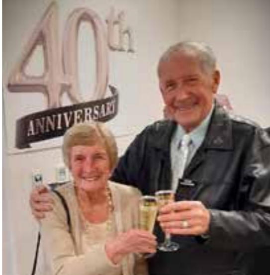
Vibrant calendar of activities

Life here moves at your pace. Residents are free to be as involved or as independent as they choose – whether that means filling the week with activities and social events, or simply enjoying the comfort and privacy of their own space.