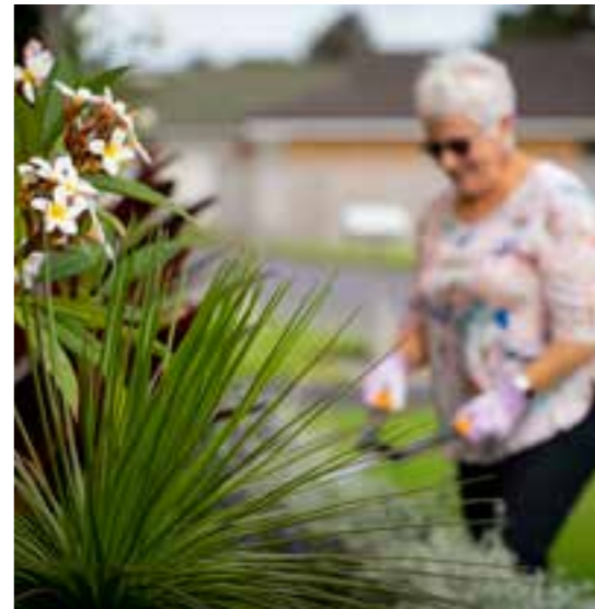
On-site gardeners & maintenance staff