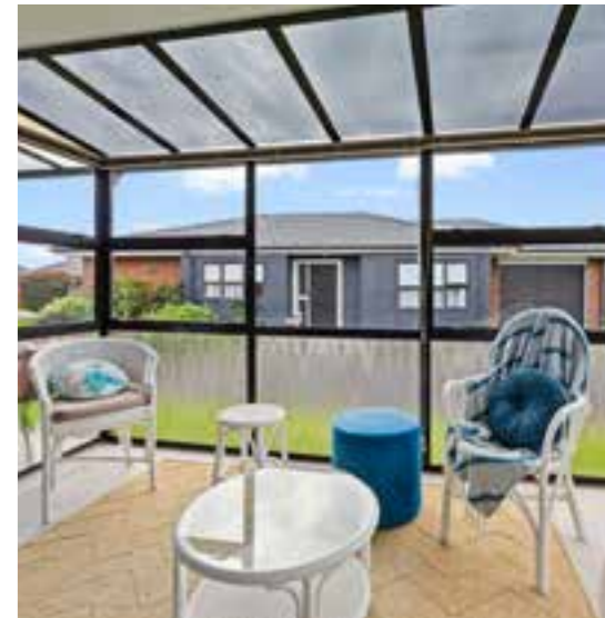
Private terraces and conservatory