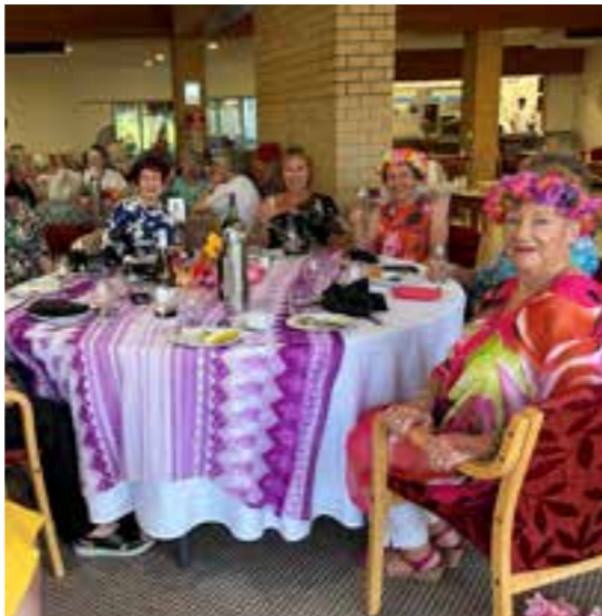
Social functions and themed parties