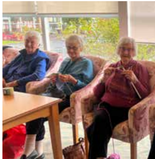
Interest groups and Social Clubs