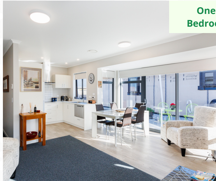
One & Two Bedroom Villas

Ranfurly Manor Retirement Village offers a range of accommodation options including independent living units, assisted living apartments, and care suites in the heart of Feilding. We also offer on-site rest home, hospital, and dementia healthcare services. This can provide peace of mind for seniors who may have a change in healthcare needs.