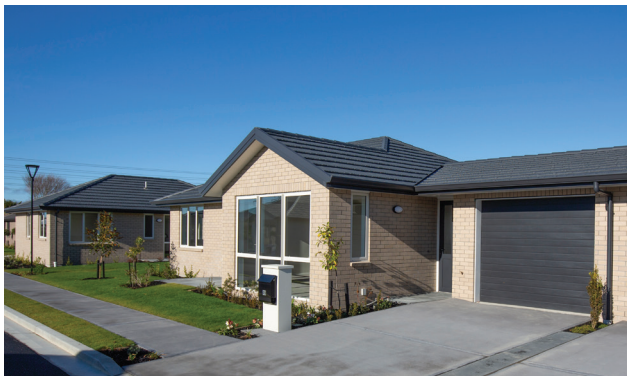
Above | Enjoy living in a welcoming and vibrant community