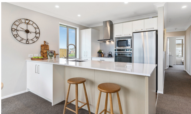
Above | Entertain guests in your full sized kitchen