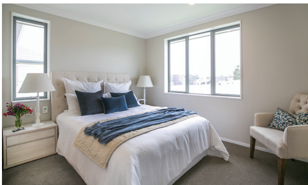
Above | Relish in your spacious master bedroom