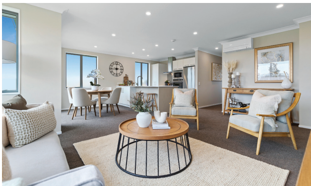
Above | Love open plan living. Perfect for entertaining