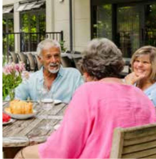
Socials & resident dinners