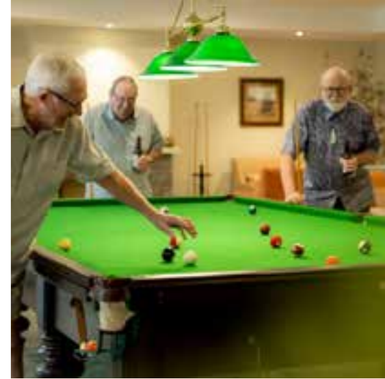
Cards, games & billiards table