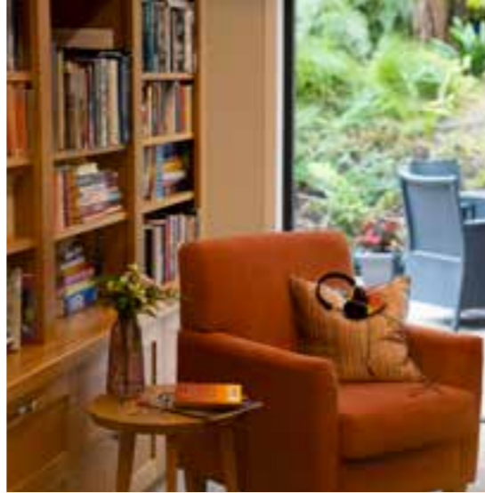
Fully stocked library