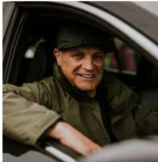
Secure undercover carpark