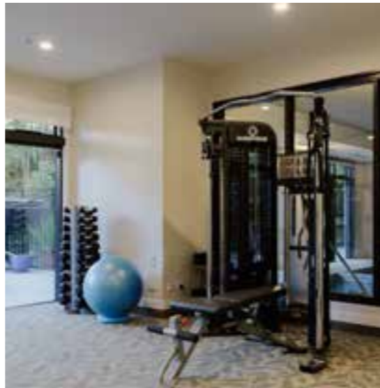
Gym & exercise options