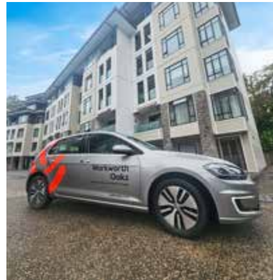
Bookable electric loan car