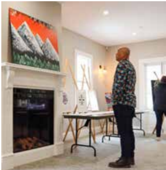
Full and Active Social Calendar