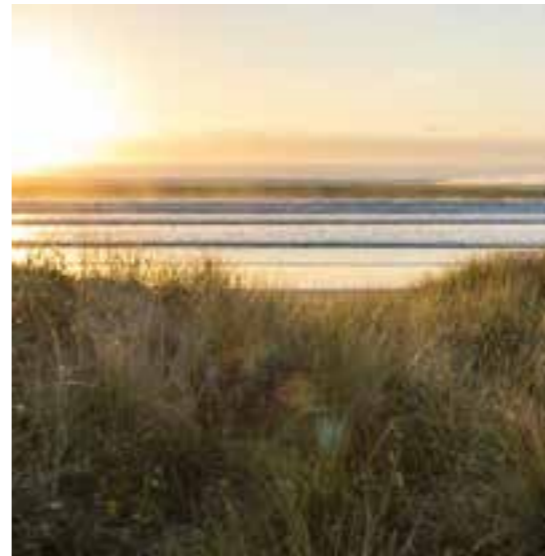
Village mini-bus for trips & outings