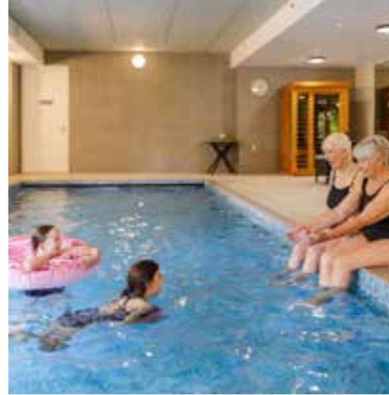
Indoor heated swimming pool, spa pool & sauna