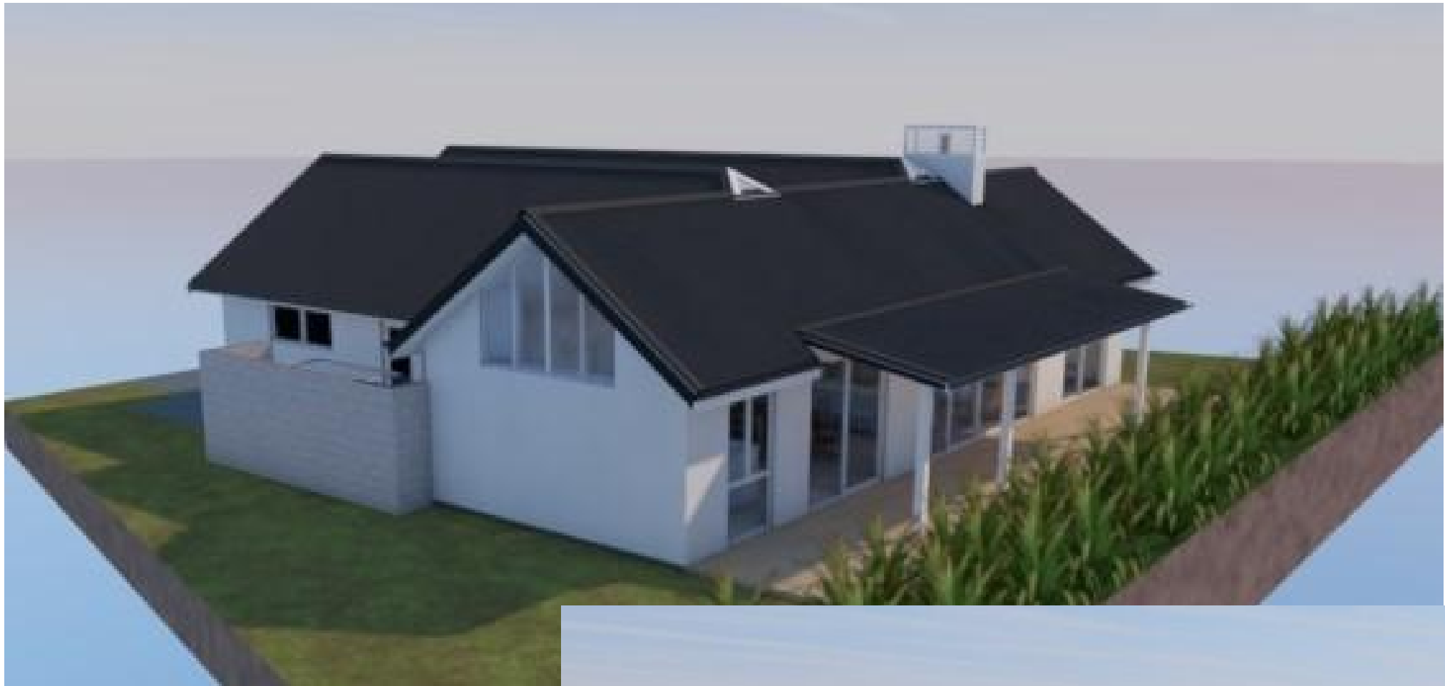
View from North West