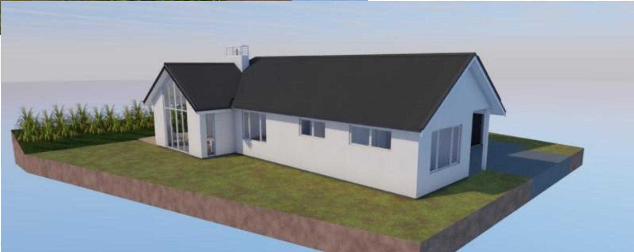
View from South West

Drawn: K Small (Reg Architect) Date: 17.01.2025 Scale: N.A.