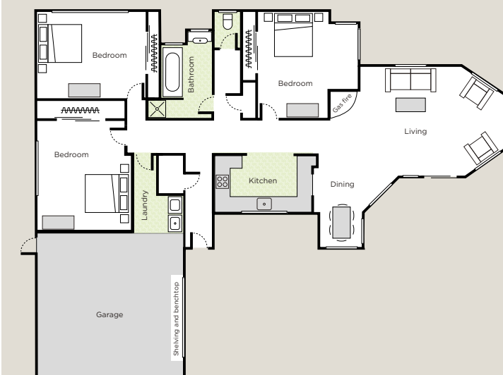
Typical 3-bedroom villa

The rest home and hospital atmosphere at is warm and vibrant, and rooms have lovely outlooks onto lush green landscaped gardens that attract tui and other native birds.